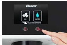
4.3" touch display with touch free dispensing