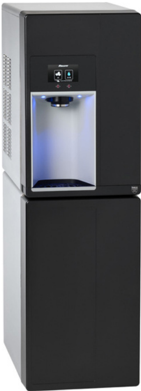
Shown with optional base stand