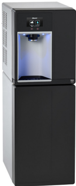
Shown with optional base stand #00956292