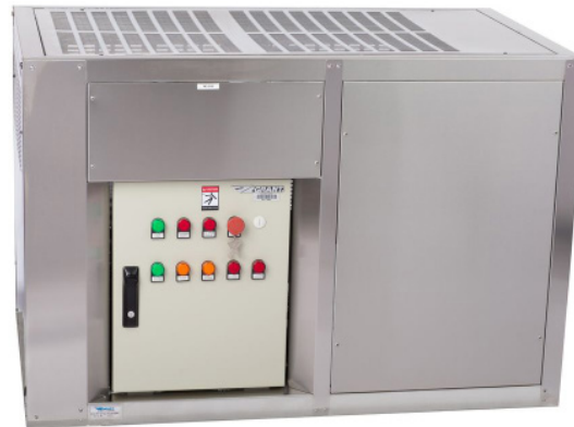
FFo.4AR / FFo.6AR Includes stainless steel covers

The FFAR Series Subzero Flake Ice Machines are designed using advanced technology, with highly economical energy consumption, excellent performance and ease of operation.