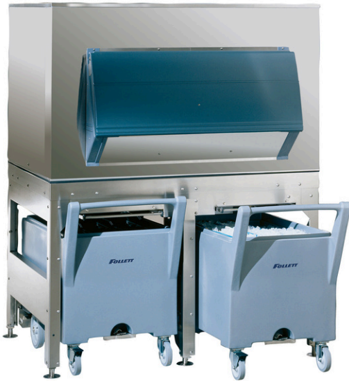
Gravity ice dispense eliminates scooping