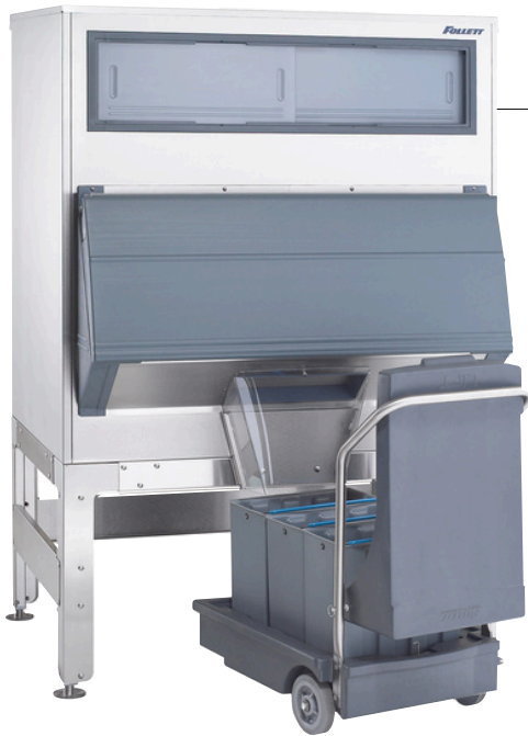
Shown with SmartCART™ 75, other configurations available

Gravity ice dispense eliminates scooping