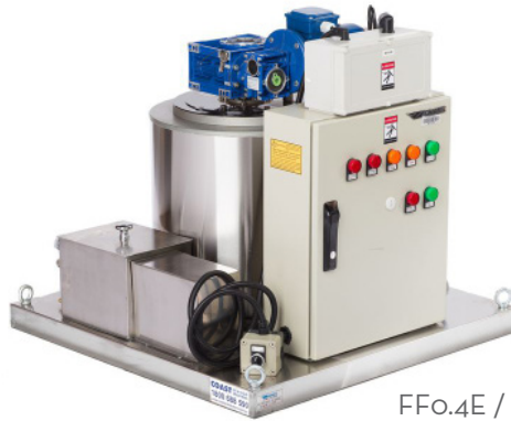
FFo.4E / FFO.6E