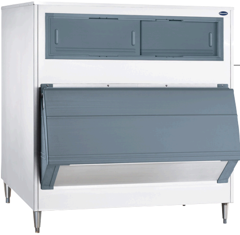
Model SG1010S-48 shown, other models will vary.